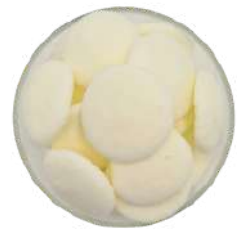
Vanilla frappé base (6g) 1746-15