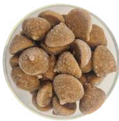
Spiced Chai booster (6g) 0842-23