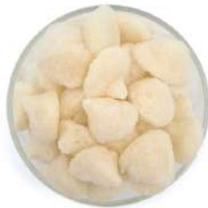
Oat frappé base (6g) 4926-22