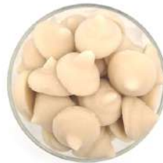
Sunflower frappé base (6g) 2331-21