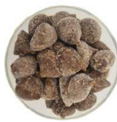
Caramel booster (4g) 3540-22