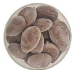
Dark chocolate (6g) 0634-23