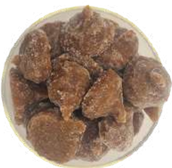
Cold Brew coffee (4g) 3747-22