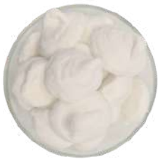
Coconut frappé base (6g) 0305-23